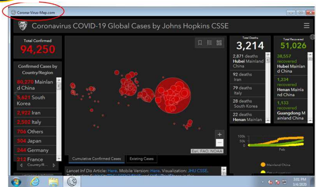
Figure 1. Screenshot of the malicious website "Corona-Virus-Map[dot]com" pretending to be a legitimate COVID-19 tracker.